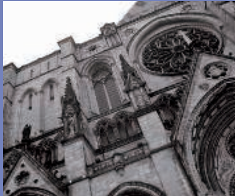
The Cathedral Church of Saint John The Divine