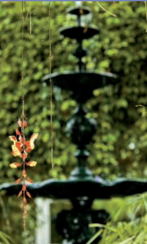
New York Botanical Garden