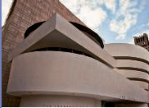
The Guggenheim Museum