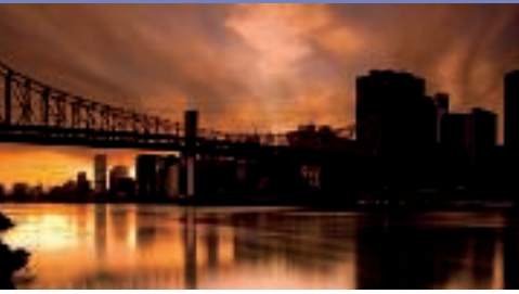
Manhattan From Roosevelt Island