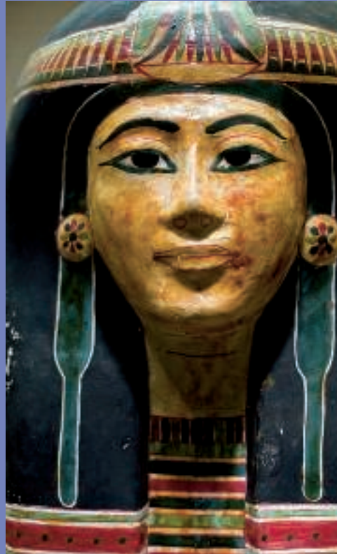
The Metropolitan Museum of Art