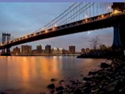
Manhattan and Williamsburg Bridges