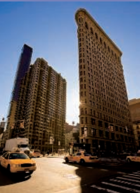
The Flatiron Building