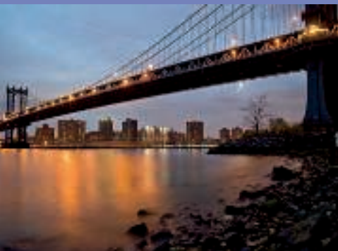
Manhattan and Williamsburg Bridges