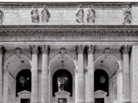
The New York Public Library