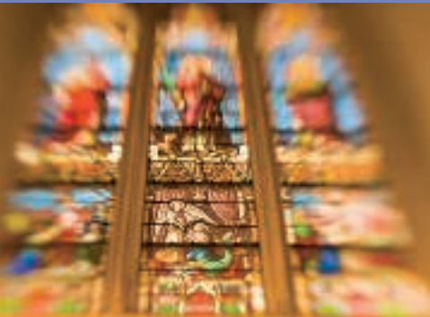
Saint Patrick's Cathedral