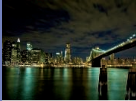
South Street Seaport