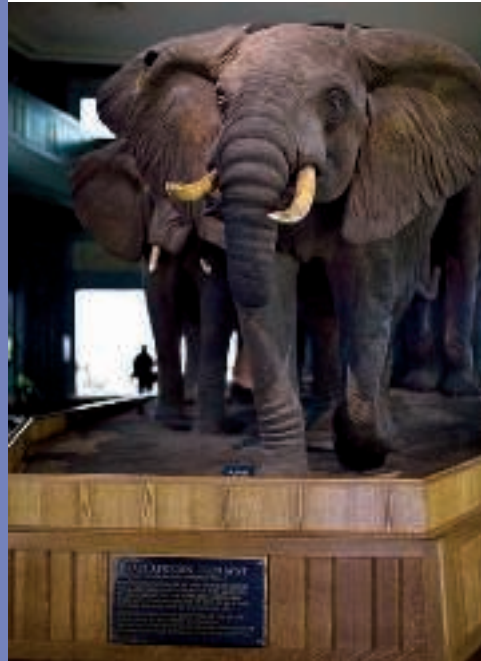
The Museum of Natural History