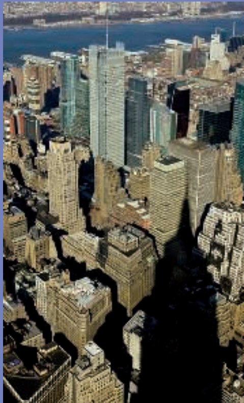
The Empire State Building