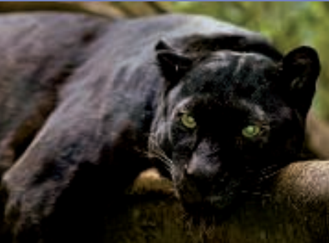
The Bronx Zoo