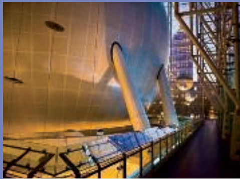
The Rose Center for Earth and Space