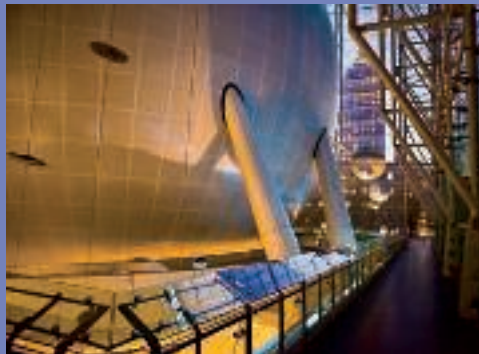
The Rose Center for Earth and Space