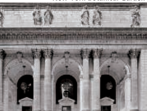
The New York Public Library