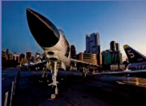
The USS Intrepid