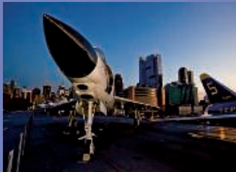
The USS Intrepid