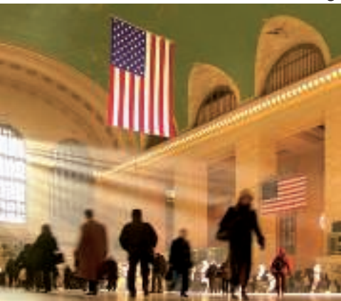
Grand Central Terminal