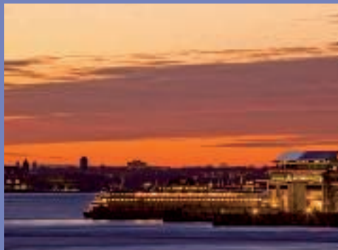
The Staten Island Ferry