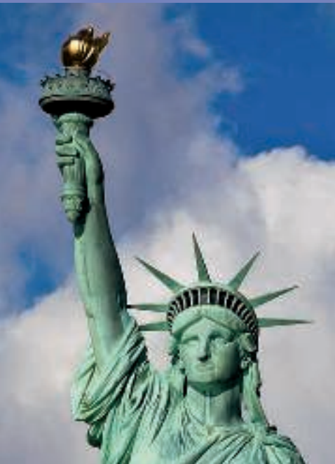
The Statue of Liberty