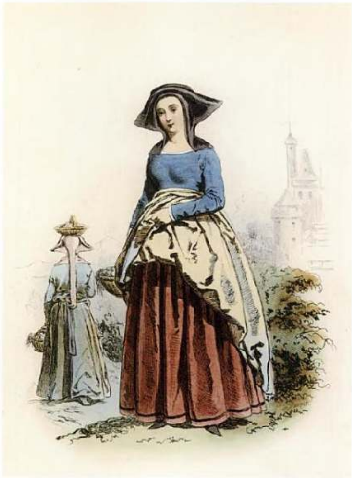
PLATE 3. Women from the outskirts of Paris (reign of Charles VII), 1443