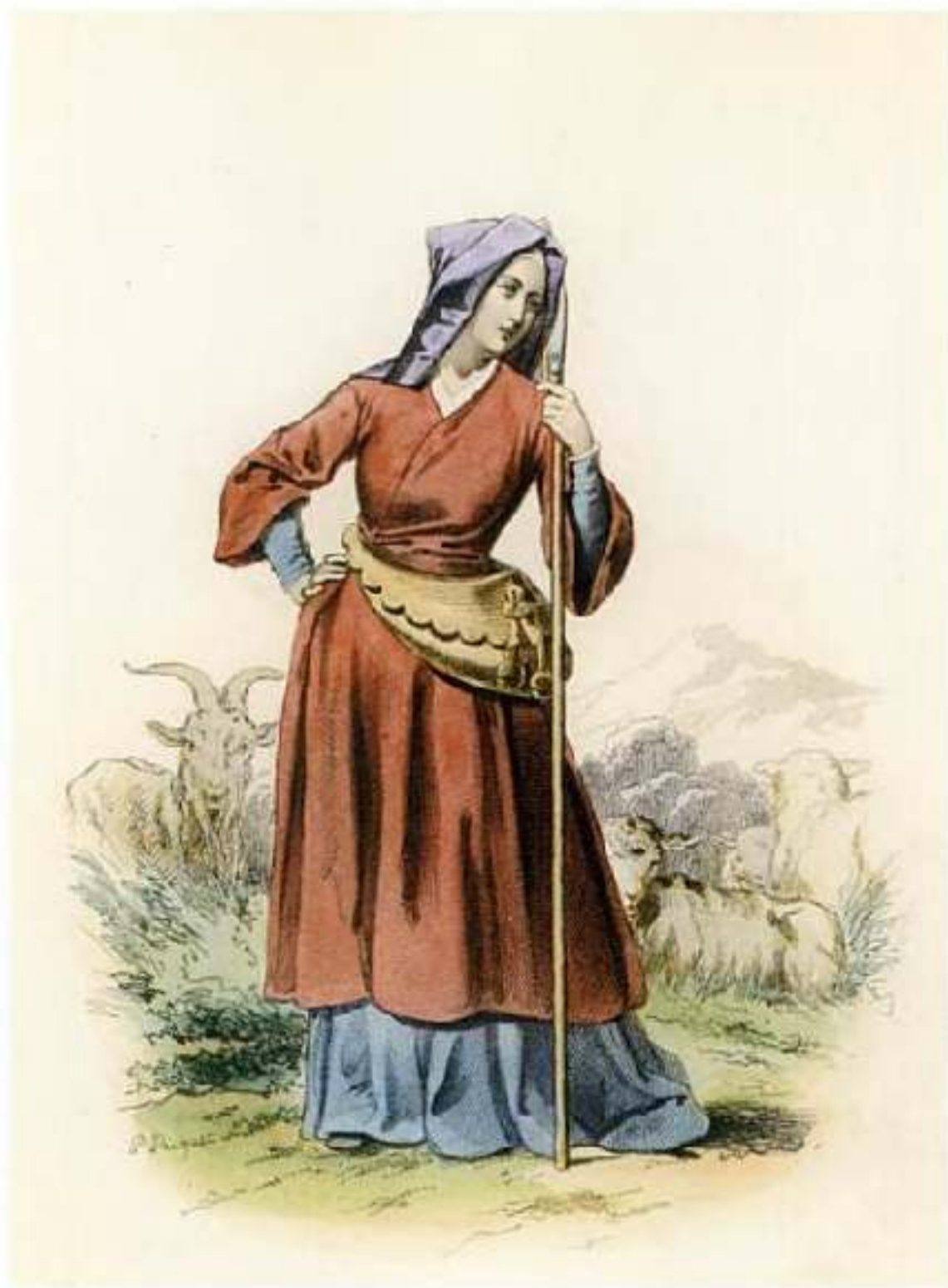
PLATE 7. Shepherdess (reign of Charles VIII), 1491.