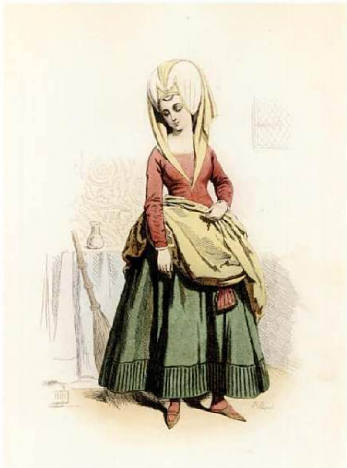
PLATE 5. Chambermaid (reign of Charles VII), 1460