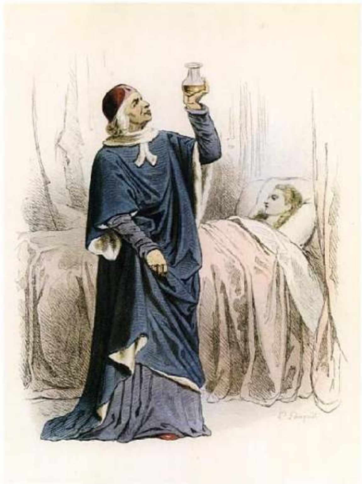
PLATE 10. Doctor (reign of Charles VIII), 1493