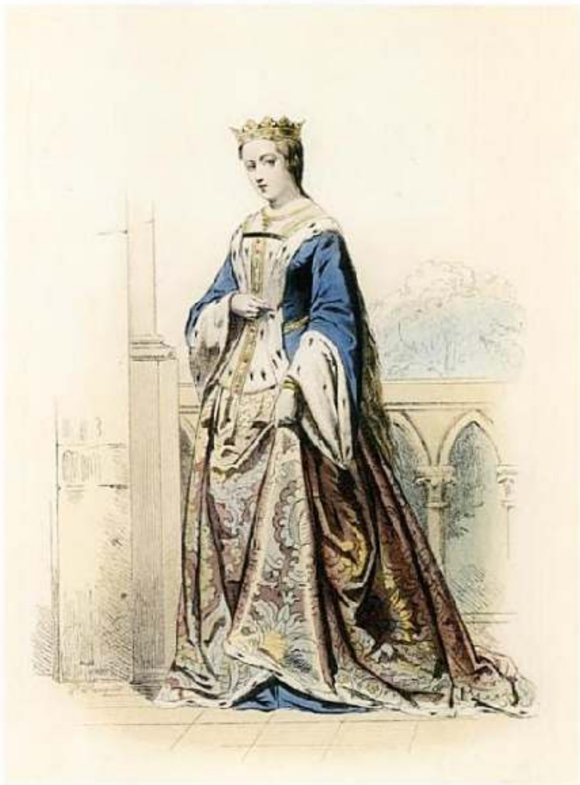
PLATE I. Princess (reign of Charles VI), 1420