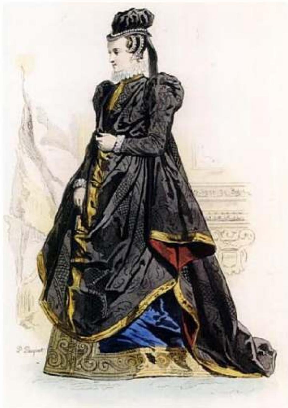
PLATE 18. Lady at Court (reign of Charles IX), 1579