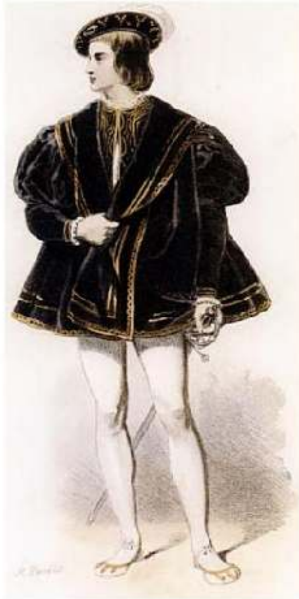
PLATE 16. François (eldest son of François I), 1534