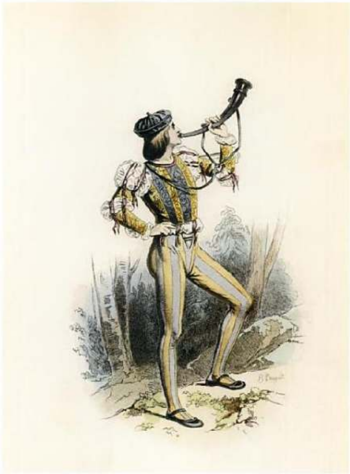
PLATE 11. Page (reign of Louis XII), 1500