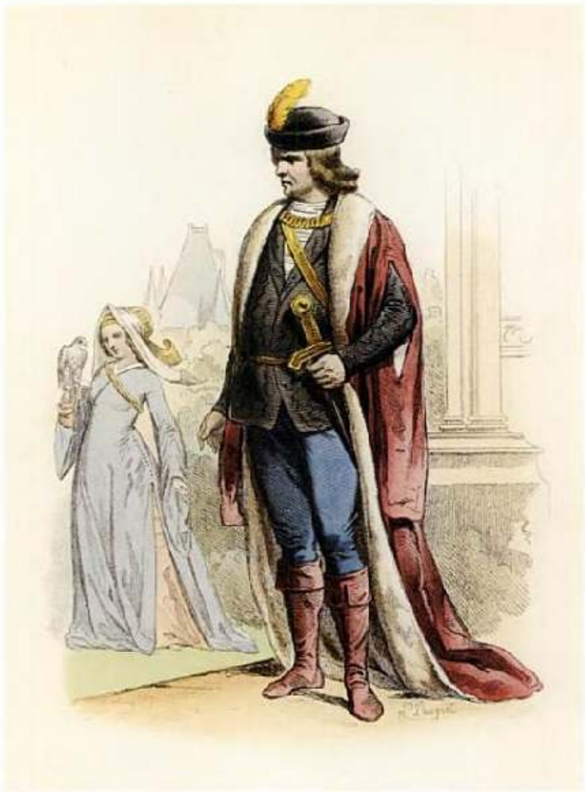
PLATE 9. Baron and Baroress (reign of Charles VIII), 1493