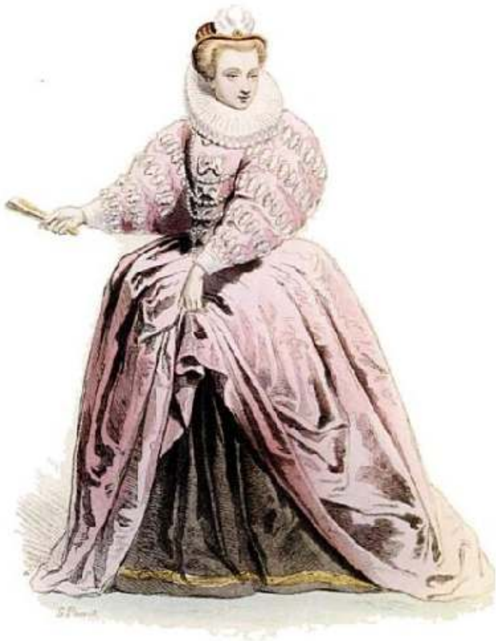
PLATE 20. Lady at Court (reign of Henri III), 1580