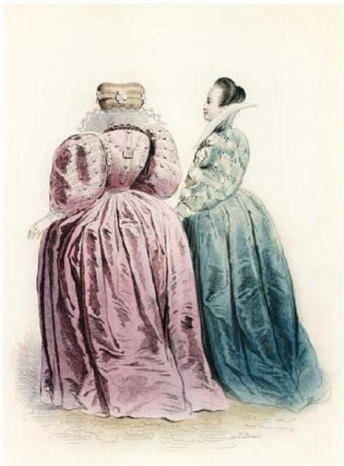
PLATE 19. Ladies at Court (reign of Henri III), 1580