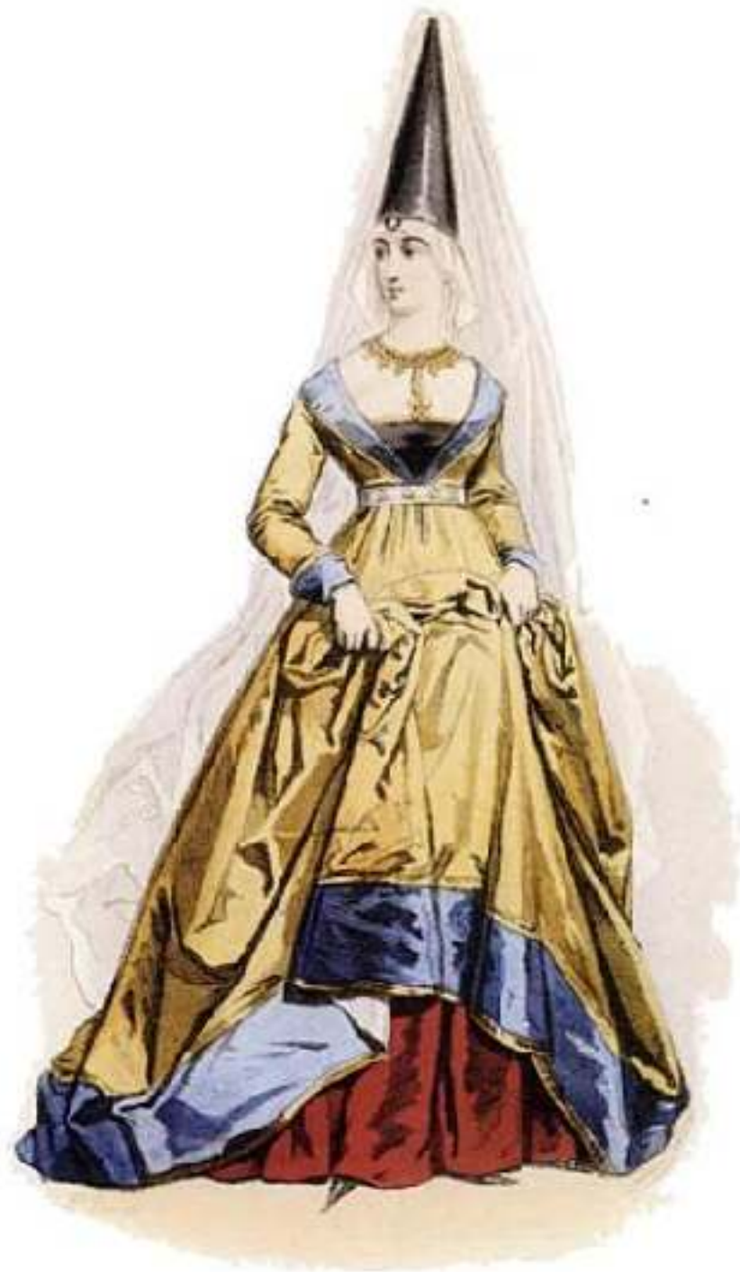
PLATE 4. Paris Fashion (reign of Charles VII), 1450