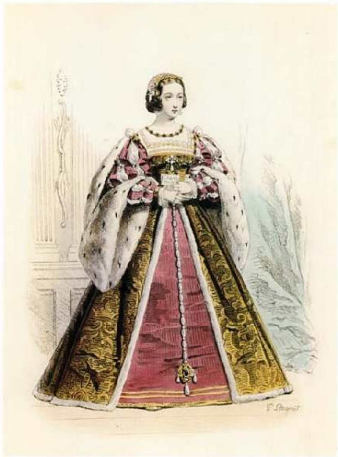
PLATE 15. Eléonore d'Autriche (2nd wife of François I), 1530