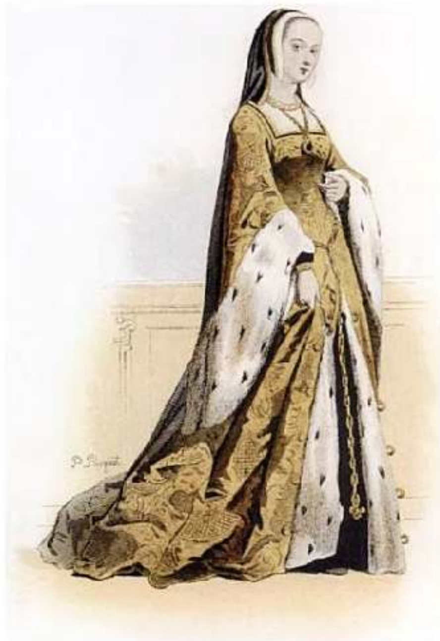
PLATE 12. Anne de Bretagne (2nd wife of Louis XII), 1500