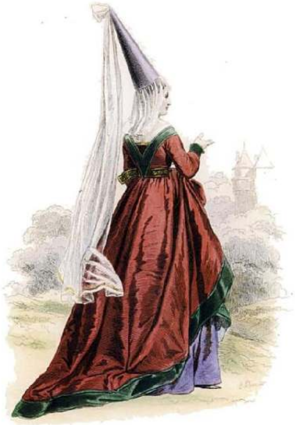
PLATE 6. Lady of Quality (reign of Charles VII), 1460