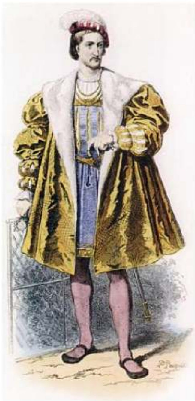
PLATE 14. Henri d'Albret (grandfather of Henri IV), 1527