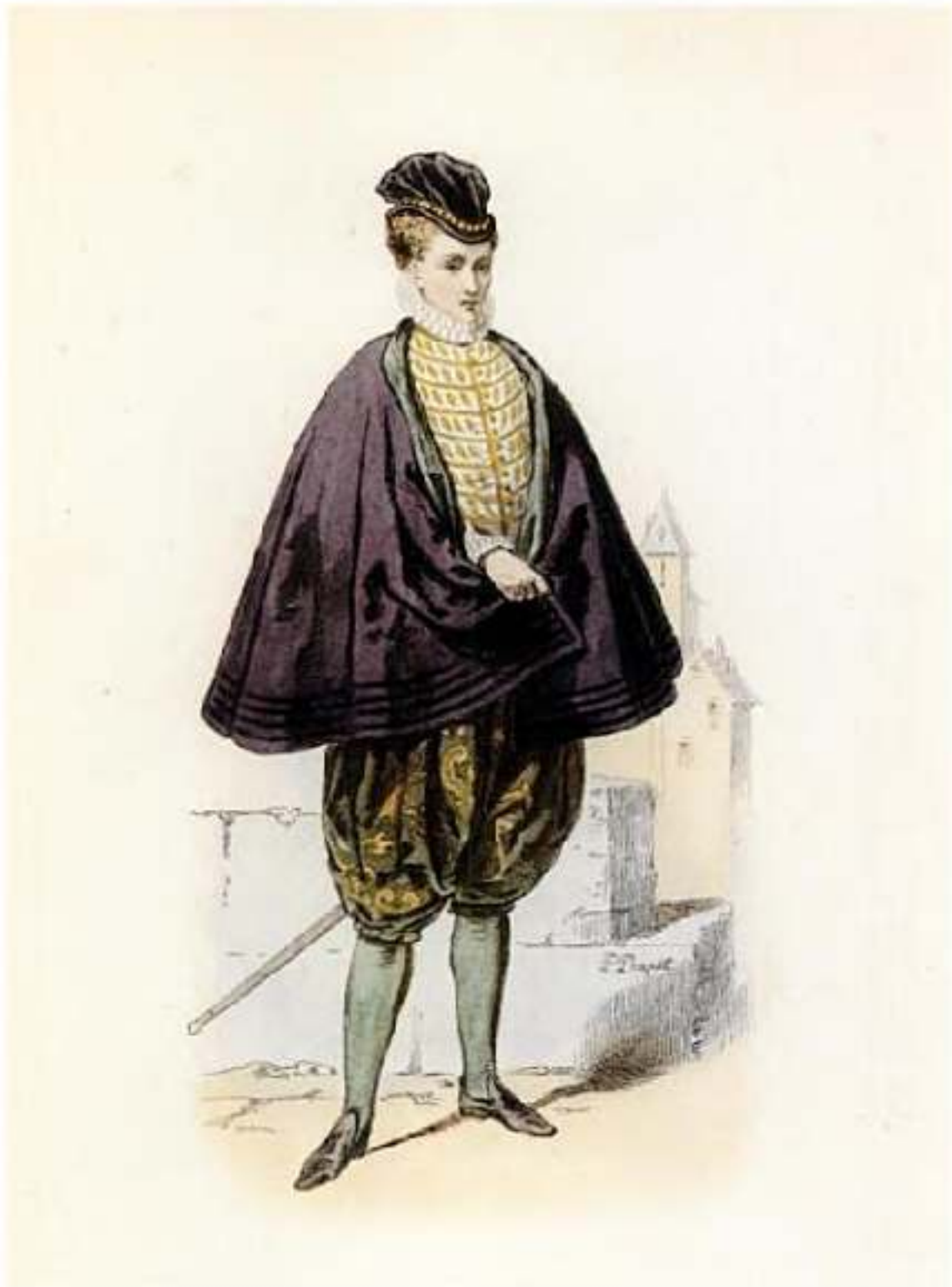
PLATE 17. Gentleman (reign of Charles IX), 1572