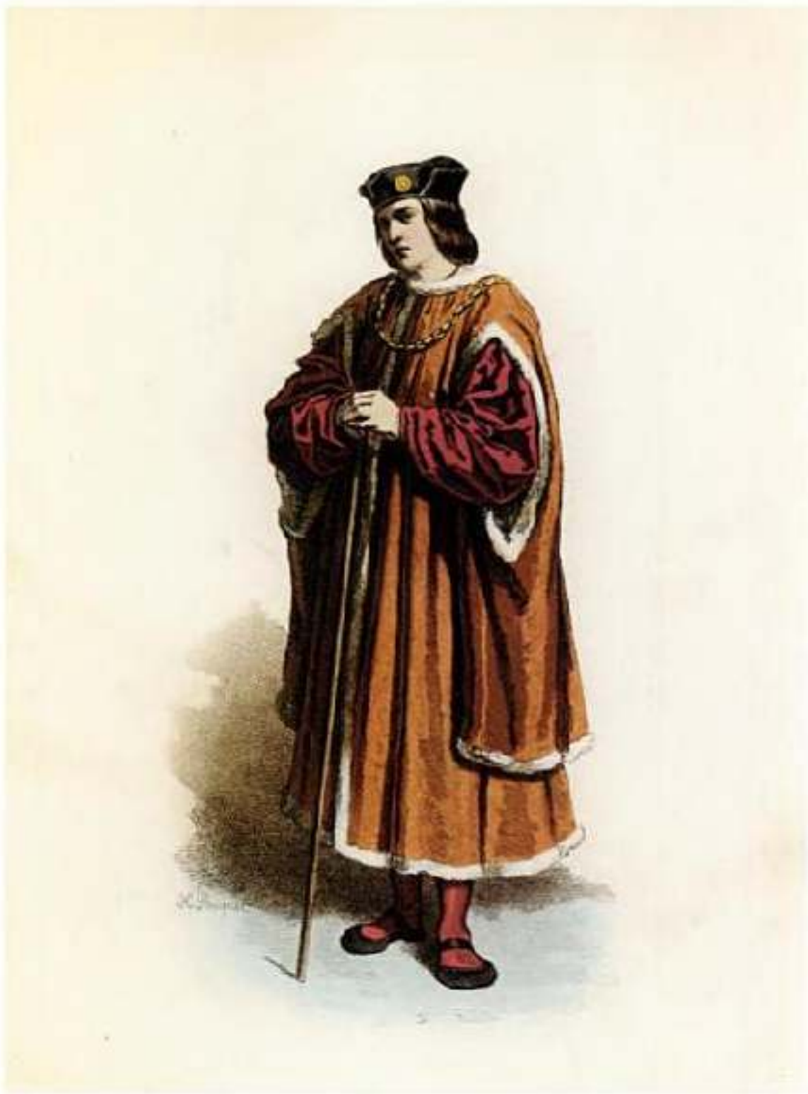
PLATE 13. Burgher (reign of Louis XII), 1510