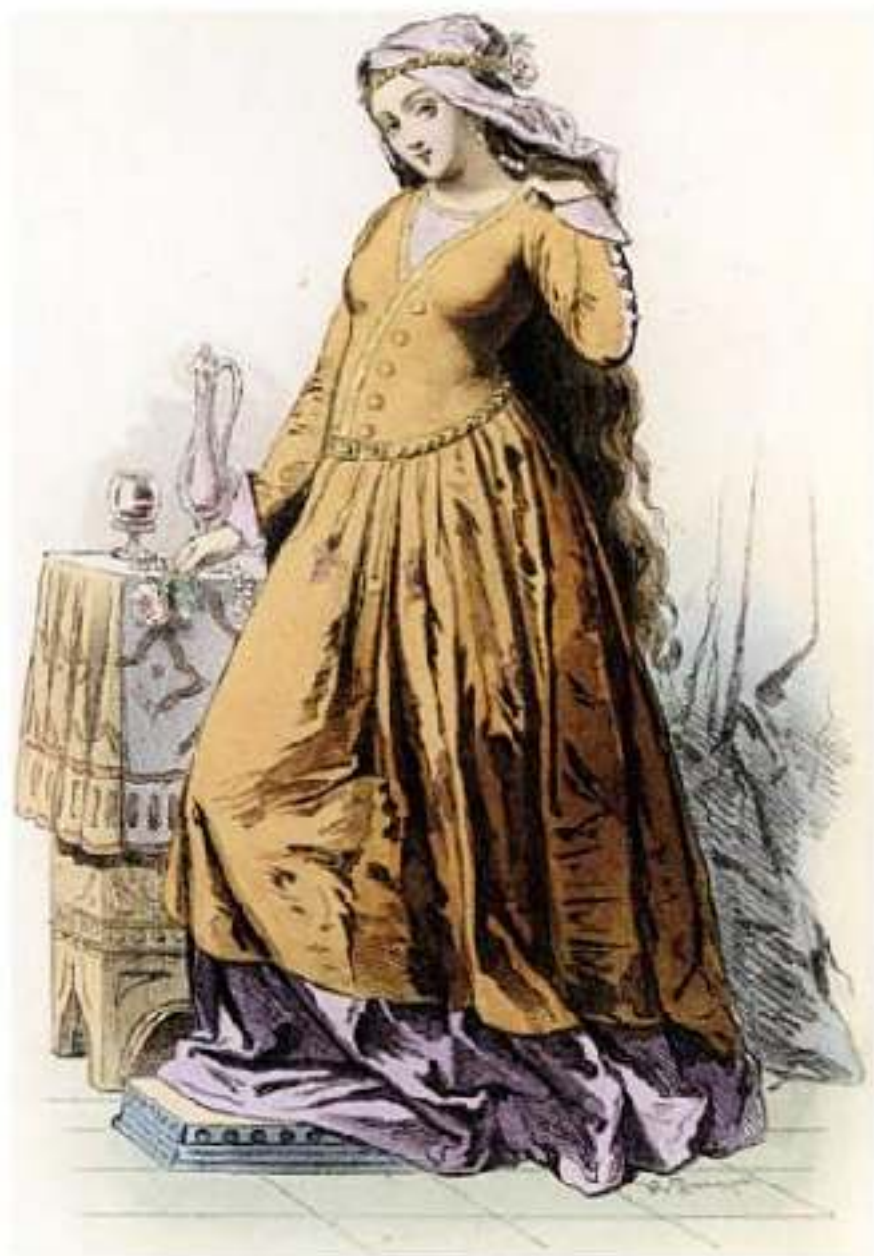
PLATE 8. Courtesan (reign of Charles VIII). 1491