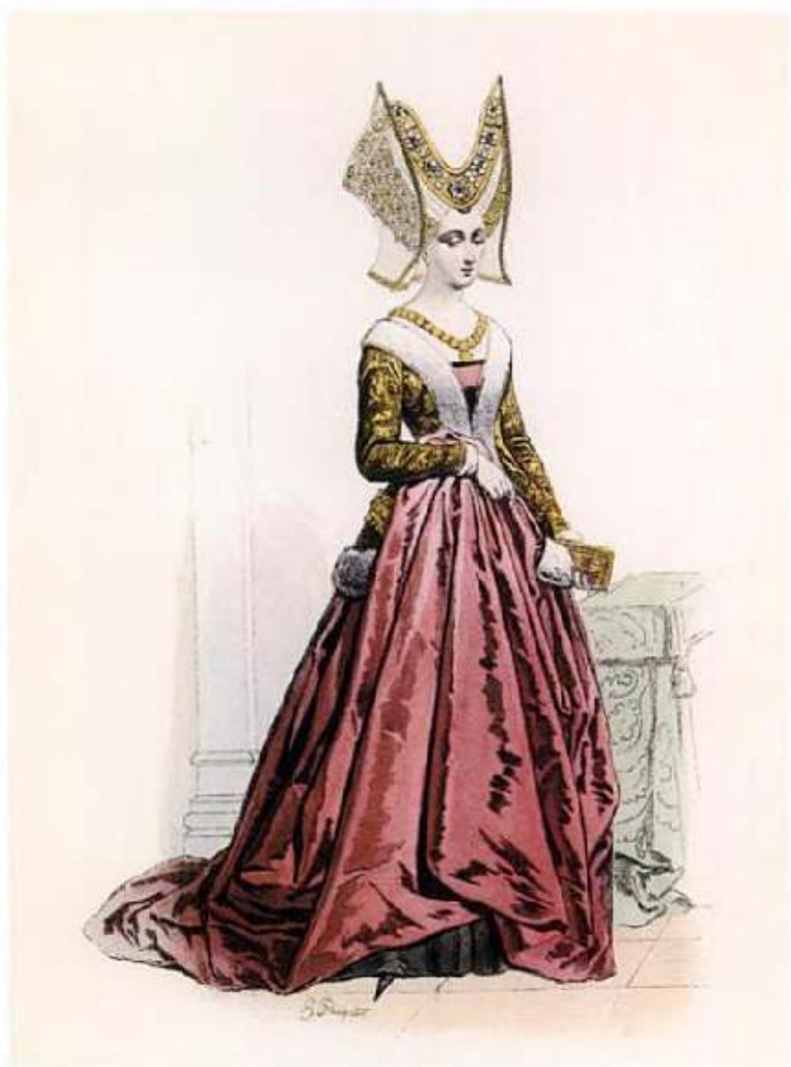
PLATE 2. Eude-Juvénal des Ursins (reign of Charles VI), 1420