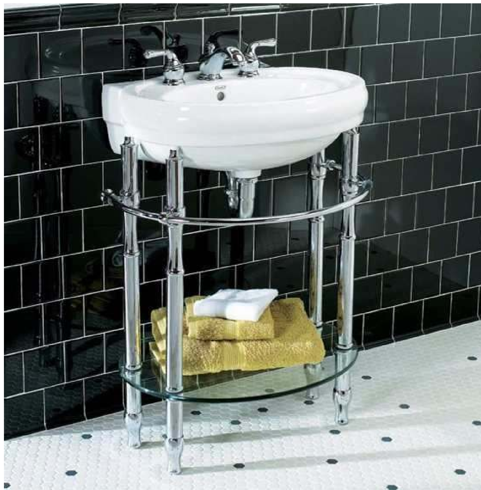
This wall-hung sink with its traditional two-handled faucet reflects the Art Deco style of the floor tiles. The glass-and-steel base is mostly decorative.