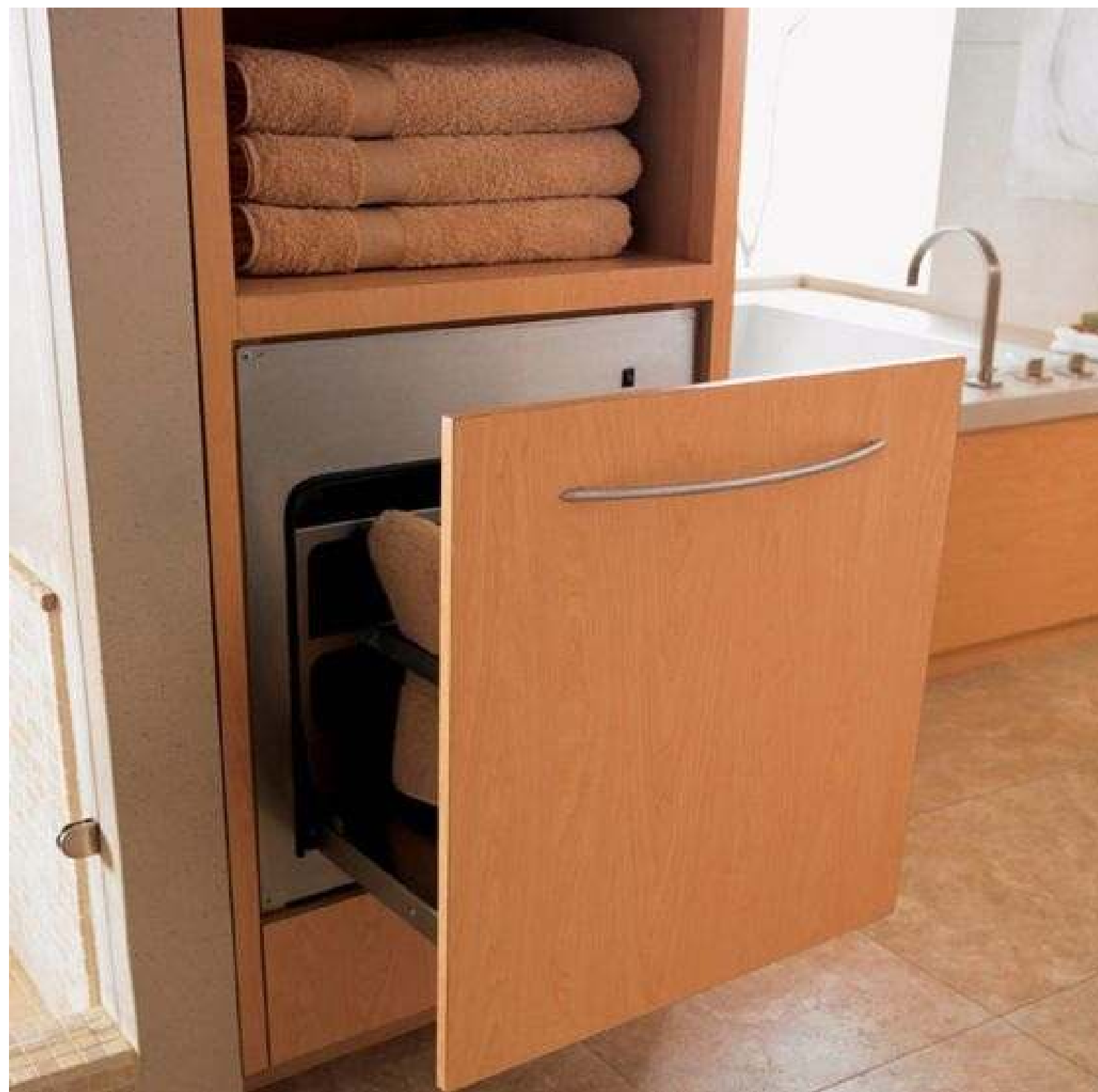
A towel warmer drawer built into a linen cabinet is a discreet yet extravagant addition to the bathroom.